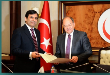
Delegation of Punjab State, Pakistan Visited Turkey

"Grant Agreement in the Field of Health between Government of Republic of Turkey and Government of Republic of Yemen" was Signed